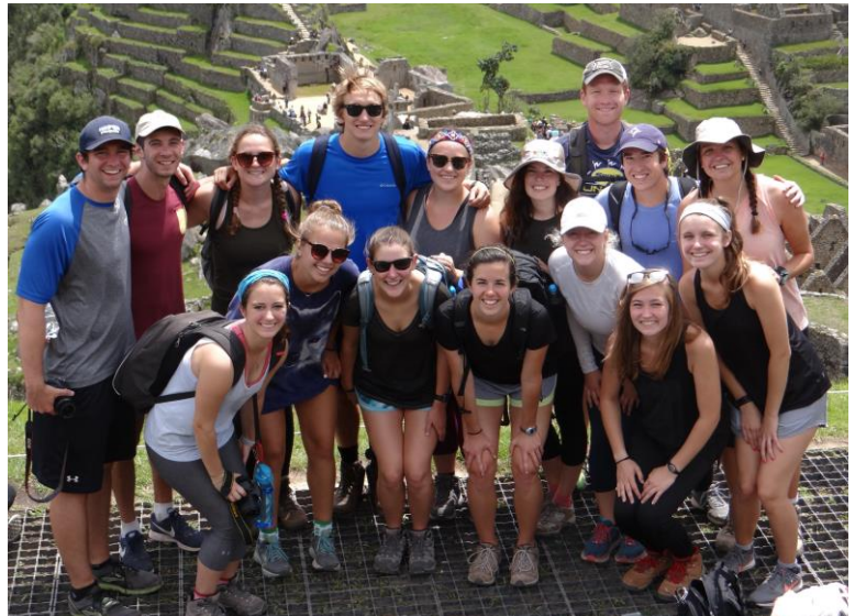
Participants of the 2018 Chile Program

Over 90 majors making an impact on their community through several community-engaged classes with 13 full-time and one part-time faculty.