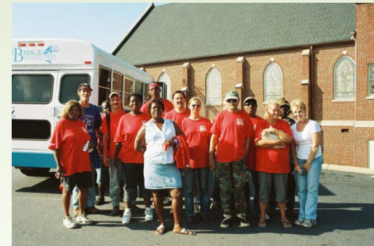
Group Walk Worship