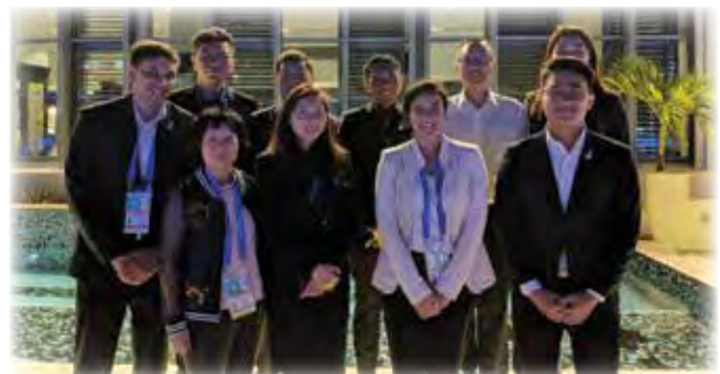
Singapore's APEC Voices delegates with H.E. Dr Mohd Maliki Bin Osman, Senior Minister of State for Foreign Affairs and Defence and Mayor of South East District and Dr Tan Wu Meng, Senior Parliamentary Secretary for Foreign Affairs and Trade and Industry.