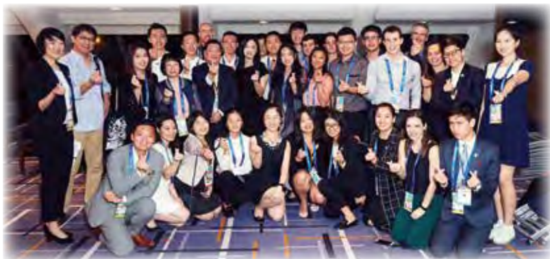
APEC Voices 2018 officials and delegates with Ms Yao Chen, Guest Speaker at the Dialogue Session.

APEC Voices delegates attended a sharing session by Yao Chen, a Chinese actress and philanthropist. In 2014, Time had named her as one of the most influential people on the Time 100 list. She was also listed by Forbes as the 83rd most powerful woman in the world. Several Western media outlets have even nicknamed her as “China’s answer to Angelina Jolie.” She shared her UN refugee work with the APEC Voices delegates and how she had been making a difference to create an impact for the community in China. She encouraged the young delegates to have a positive attitude and contribute their best for their communities.