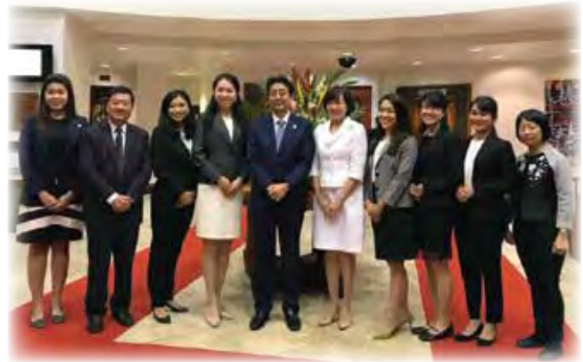
APEC Voices officials and Japanese APEC Voices delegates with H.E. Shinzo Abe, Prime Minister of Japan and Mrs Akie Abe.

"I have a personal attachment to the APEC Voices Program because I launched it in 1998 in Malaysia. Since then, APEC Voices of the Future program has not looked back, going from strength to strength, and here we are today, celebrating its 20th Anniversary."