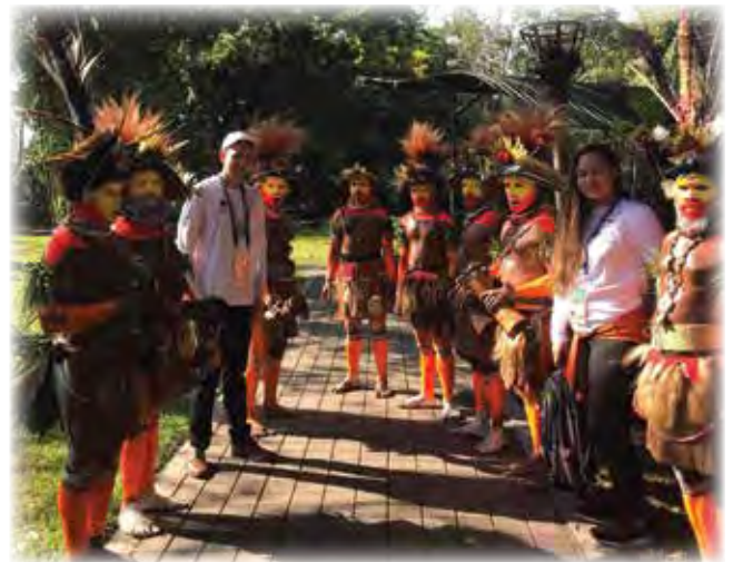
APEC Voices delegates visiting the Port Moresby Nature Park, away from the hustle and bustle of the Port Moresby city area.

After the visit to the ExxonMobil LNG Plant, the delegates proceeded to the Port Moresby Nature Park for lunch, away from the hustle and bustle of the Port Moresby city area. Upon their arrival, the delegates were greeted with song and dance by the tribes dressed in traditional tribal outfits. The Port Moresby Nature Park is Papua New Guinea's leading botanical and native zoological park and garden, which showcased the best of PNG's flora and fauna. The park has been home to over 250 native animals, including birds of paradise, tree-kangaroos, cassowaries, wallabies, snakes, crocodiles, hornbills and multiple parrot species.