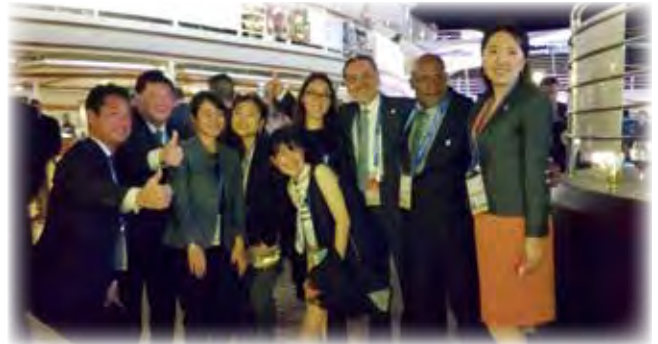
APEC Voices delegates networking with business leaders at the APEC CEO Reception on board The Pacific Explorer.