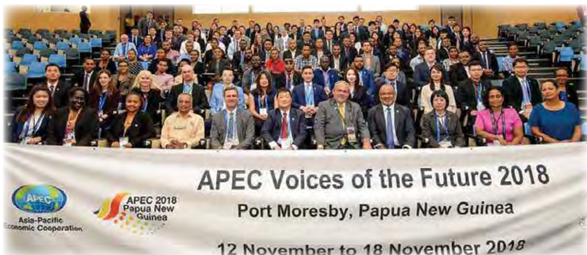
APEC Voices 2018 officials and delegates from the 15 APEC Member Economies at the APEC Voices 2018 Opening Ceremony held at the University of Papua New Guinea.