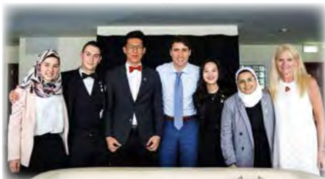
APEC Voices delegates from Canada with H.E. Justin Trudeau, Prime Minister of Canada.