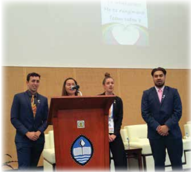
Team from APEC Voices New Zealand presenting their Economy Report at the APEC Voices 2018 Youth Summit.

The delegates were divided into four main groups, and each group was assigned to discuss and tackle issues related to various topics, namely: Harnessing Technology for a Better Future, the Role of Education in Preparing our Youth for the Future, Digital Innovation: Opportunities and Challenges for our Young People and Harnessing Inclusiveness: Challenges and Opportunities. The delegates then disbursed to various parts of the campus for their deliberations.