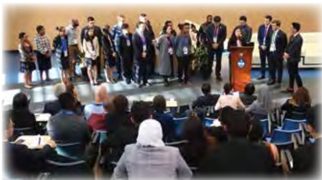
Group presentation from the APEC Voices 2018 delegates on their deliberation at the APEC Voices 2018 Youth Summit.

The group presentations were of high standards with much in-depth discussion, and the delegates articulated themselves well during the question-and-answer sessions. To tackle the issue of inclusivity, one group suggested coming up with APEC key performance indicators for each APEC economy so that the APEC Leaders would be able to better identify gaps and produce targeted solutions. Delegates also recognized the importance of education and that some economies do not have equal access to education. They hence proposed an APEC Youth Fund that could benefit and provide struggling economies with necessary resources for an improved education system for young people. The representatives worked vigorously through the night on board the cruise ship to finish the tasks assigned.