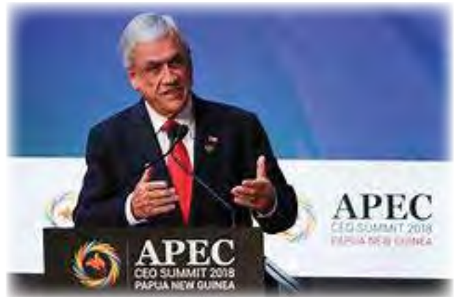
H.E. Sebastian Pinera, President of Chile addressing the APEC CEO Summit 2018 on board the Cruise Liner The Pacific Explorer.