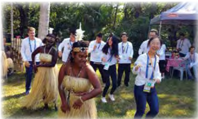
APEC Voices delegates learning the traditional cultural dance at the Port Moresby Nature Park.

During their stay in Port Moresby, delegates also visited the National Museum and Art Gallery showcasing artifacts from 19 provinces of Papua New Guinea, with collections that dated as far back as 1800. The delegates saw the best of PNG as they explored SME stalls at the International Convention Centre, where many local arts and crafts were on display, showcasing the rich tribal culture of Papua New Guinea.