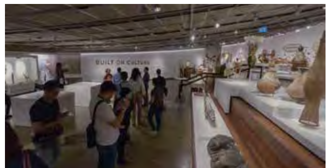
Visiting the National Museum and Art Gallery of Papua New Guinea was a rare treat for the APEC Voices delegates.

During their stay in Port Moresby, delegates also visited the National Museum and Art Gallery showcasing artifacts from 19 provinces of Papua New Guinea, with collections that dated as far back as 1800. The delegates saw the best of PNG as they explored SME stalls at the International Convention Centre, where many local arts and crafts were on display, showcasing the rich tribal culture of Papua New Guinea.