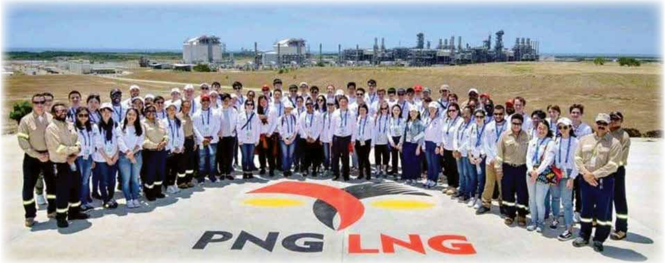
APEC Voices 2018 delegates visiting the ExxonMobil LNG Plant at Caution Bay on the South Coast of PNG's Central Province.

The APEC Voices delegates and educators deserved a good break after their intense discussion at the Youth Forum 2018 on the 3rd day of the APEC Summit. The first order of the day was a specially arranged trip to the ExxonMobil PNG LNG Plant which is located 20 kilometers northwest of Port Moresby, at Caution Bay on the South Coast of PNG's Central Province. The LNG Plant was operating by receiving natural gas from the Hides Gas Conditioning Plant through a 700-kilometre pipeline.