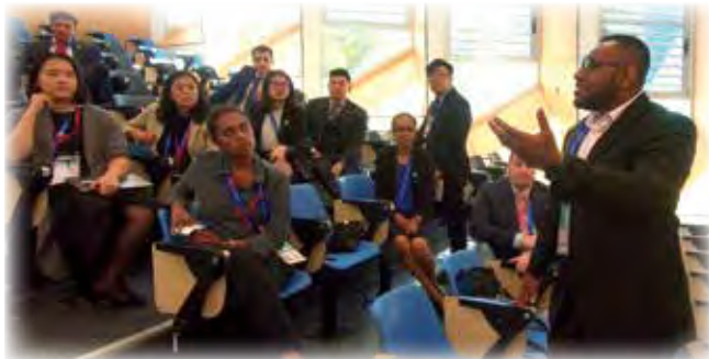
Intense discussion among the APEC Voices 2018 delegates on issues concerning young people in their respective APEC Members Economies.

Another group was specially selected by their economies to work on the APEC Youth Declaration 2018. The main framework was agreed upon and the group responsible for the Youth Declaration waited anxiously for the input of the break-up group, with the hope that the declaration would be a fair representative of the APEC Voices delegates 2018. The educators played a crucial role in facilitating the group discussions, but avoided influencing the outcome of the discussions.