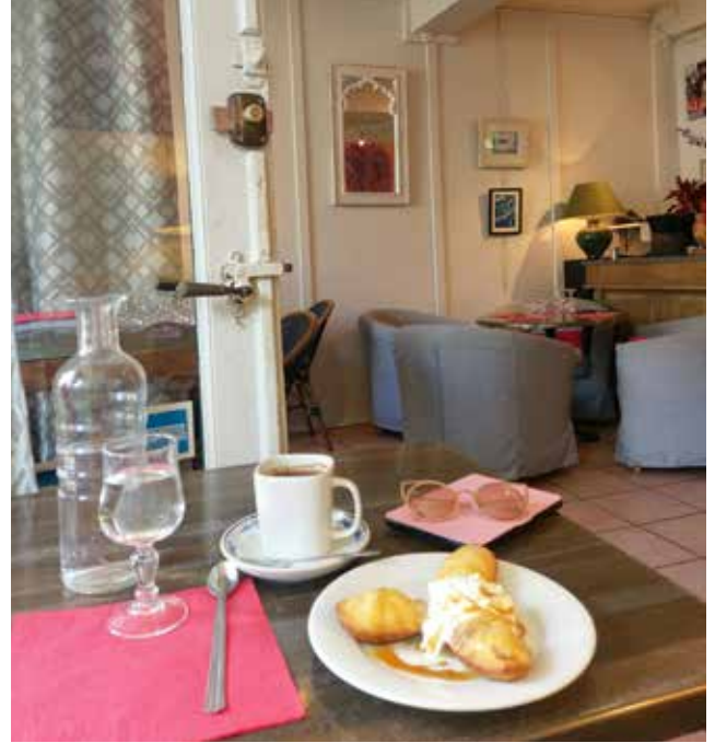
Breakfast - Submitted by Ashton Nicewonger ('17)

immersion, but it also gave me the time and leisure to apply for Master of Arts programs back in the states and to start homing in on my academic research interests.”