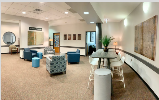
Economics Student Lounge and Study Space Riley Hall 109