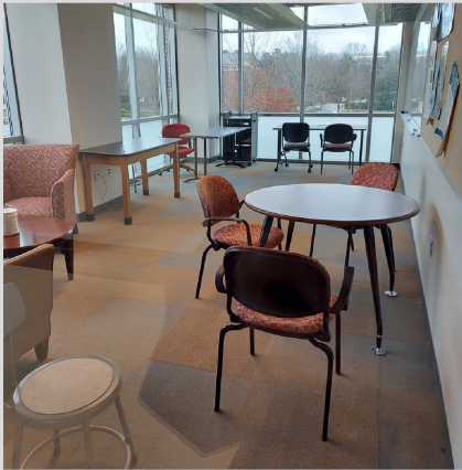
Physics Student Lounge Plyler 202