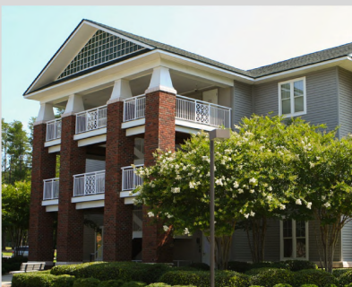
Modern Language Houses North Village Residential Complex