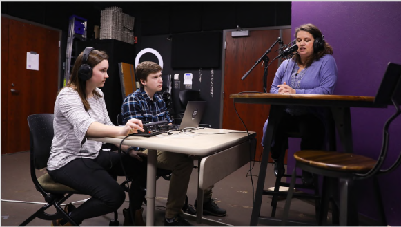
Communication Studies Media Lab Furman Hall, Suite 135