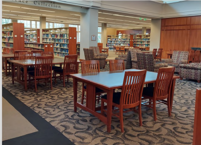
James B. Duke Library Lower Level and First Floor Spaces