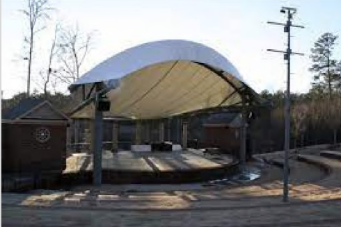
Lakeside Amphitheater Along Lakeside Trail, next to the Shi Center for Sustainability