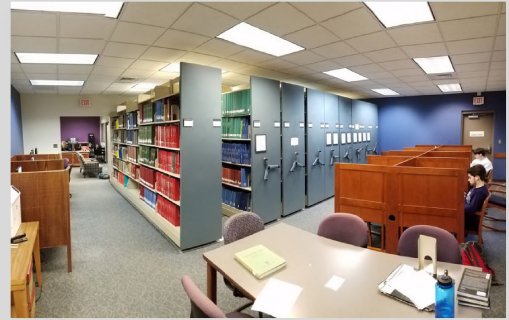
Maxwell Music Media Center and Library Daniel Music Building