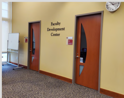
Center for Teaching and Learning 1st Floor of Duke Library