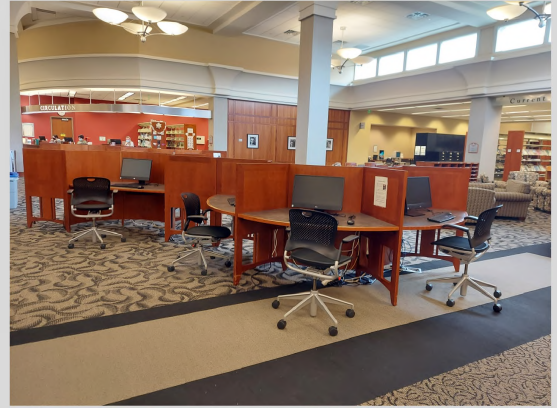
Research Commons Computer Lab Duke Library, First Floor