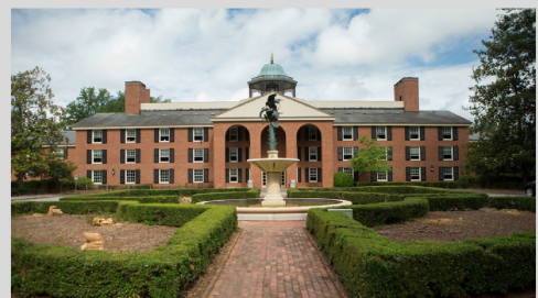
Personal Dorm Rooms