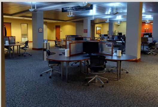
Multimedia Commons Duke Library, Ground Floor