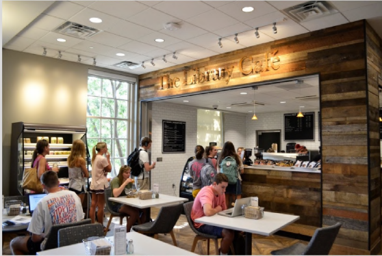
Library Cafe and Study Lounge Accessed through Duke Library Front Porch