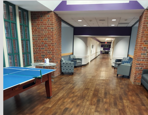
Sociology Farmer Commons 2nd Floor, Johns Hall