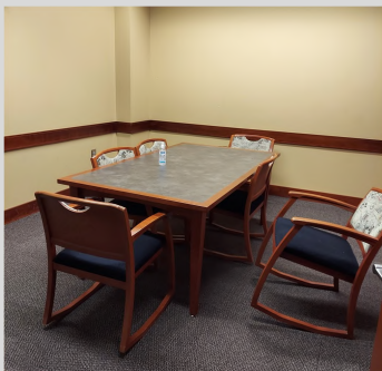
Group Study Rooms Duke Library, Lower Level and First Floor