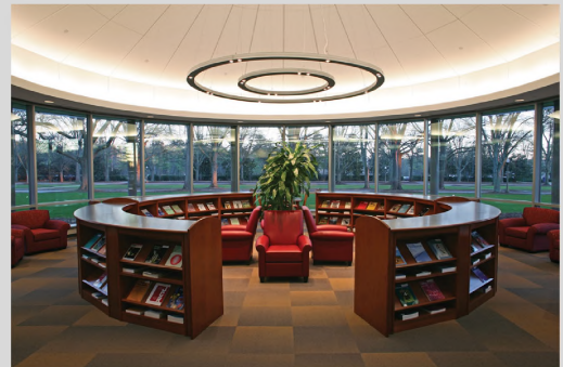
Sanders Science Library Plyler Hall near the Kohrt Commons