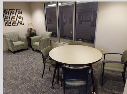
Physical Activities Center (PAC) PAC-101