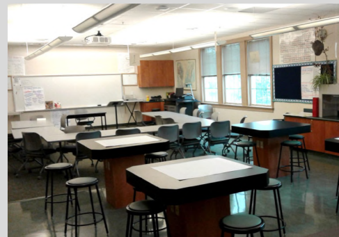
Education Department Methods Classroom Hipp Hall 205