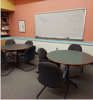
Fishbowl Study Space/Pigeonhole Lounge Math Department, Riley Hall, 2nd Floor