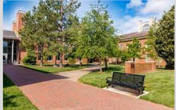
Outdoor Benches and Tables Various Spaces Around Campus