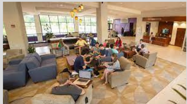
Trone Student Center Behind the Library, next to the Dining Hall