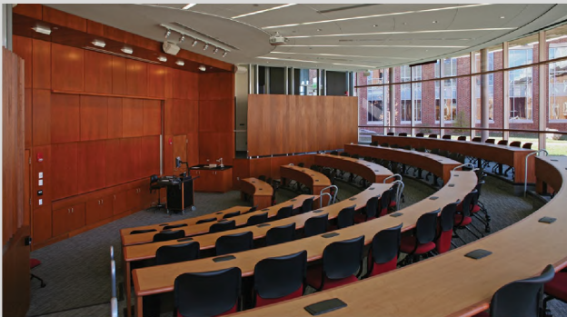
Empty Classrooms Various Spaces Around Campus