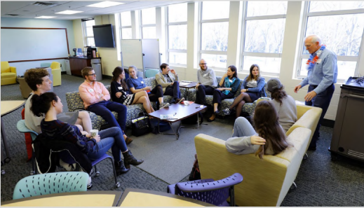
Modern Language Center (MLC) Furman Hall 226