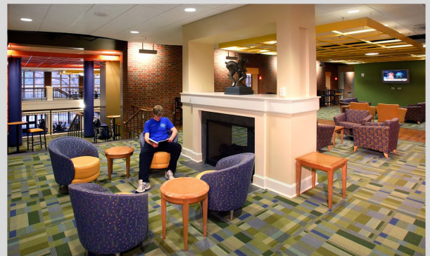
Dining Halls Various Spaces Around Campus