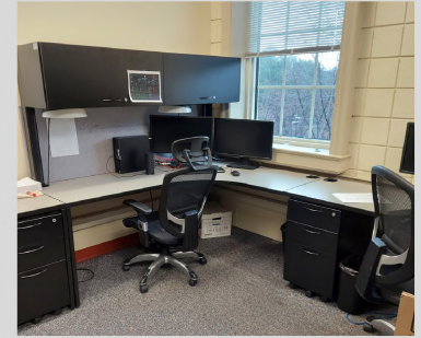
Computer Science Student Lounge Riley Hall, Second Floor