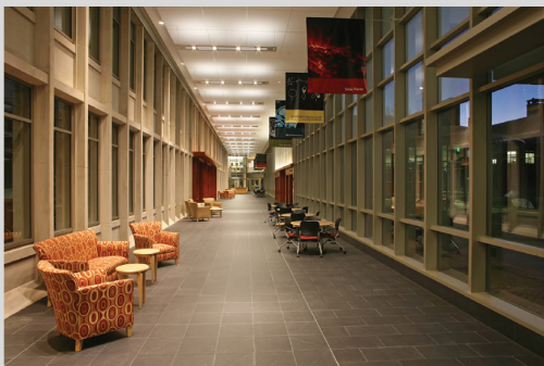
Townes Science Center Plyler Hall