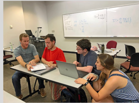
Mathematics Resource Center (MRC) 101 Riley Hall